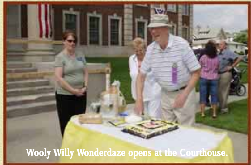
Woolly Willy Wonderdaze opens at the Courthouse.