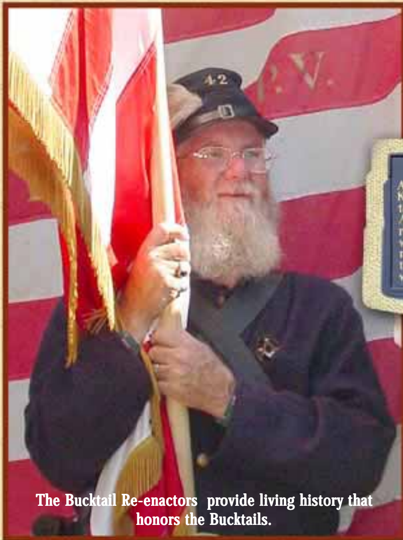
The Bucktail Re-enactors provide living history that honors the Bucktails.