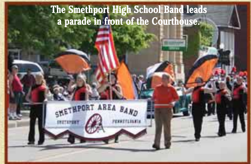
The Smethport High School Band leads a parade in front of the Courthouse.