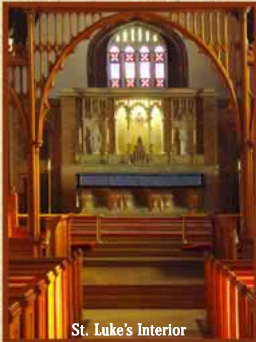
St. Luke's Interior