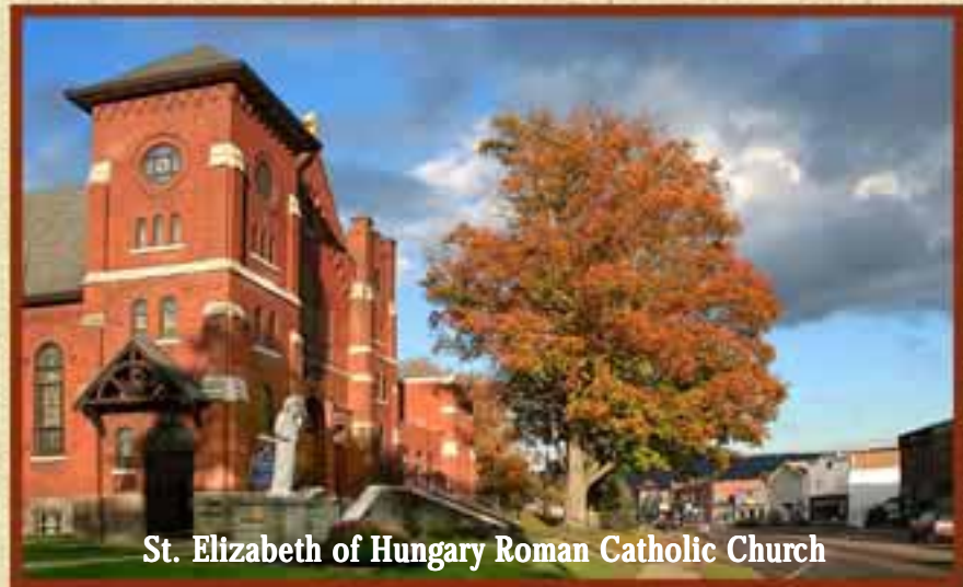
St. Elizabeth of Hungary Roman Catholic Church