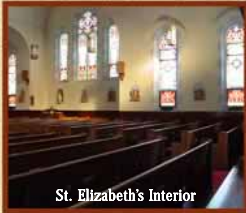
St. Elizabeth's Interior