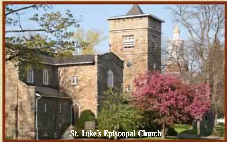
St. Luke's Episcopal Church