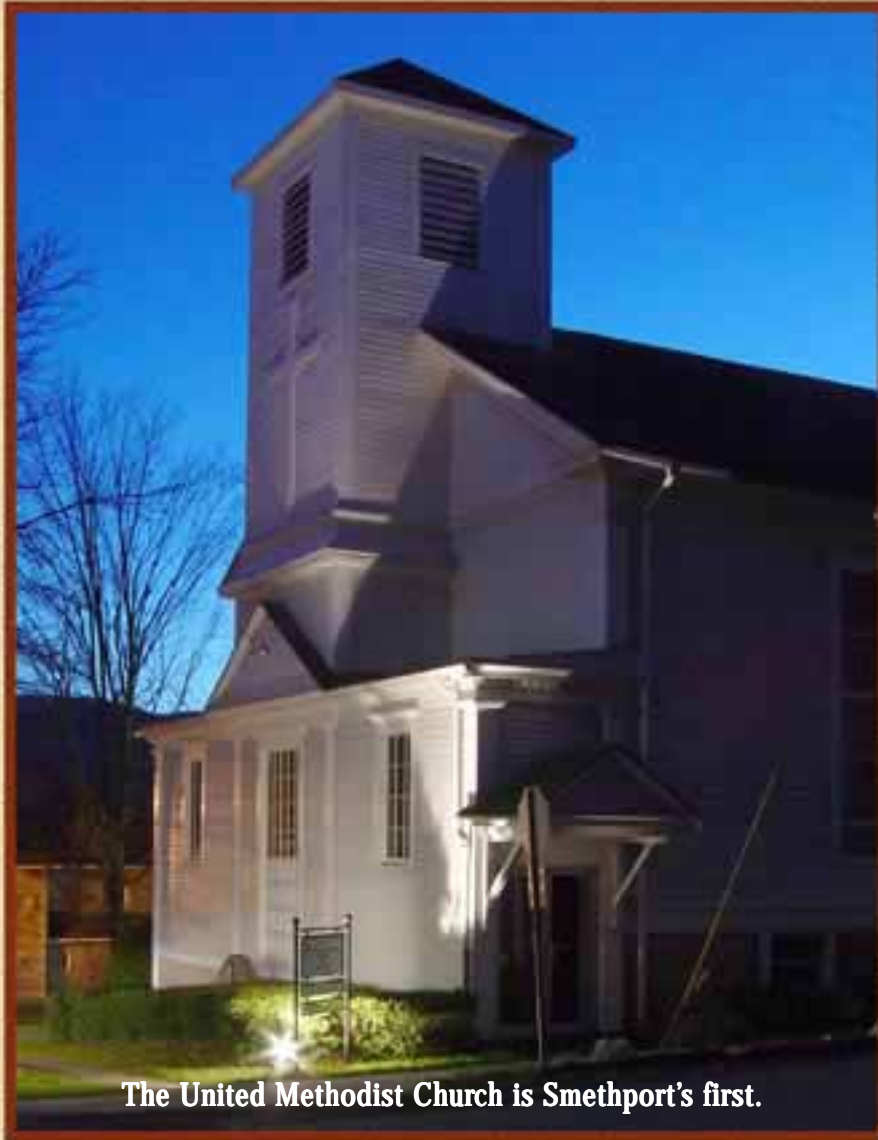
The United Methodist Church is Smethport's first.

Another example of Smethport's traditional values is reflected in the beautifully maintained churches that survive in the community. Three of these churches are included in the Historic Mansion District Walking Tour.