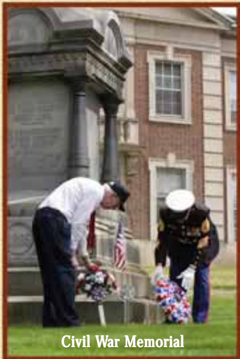
Civil War Memorial