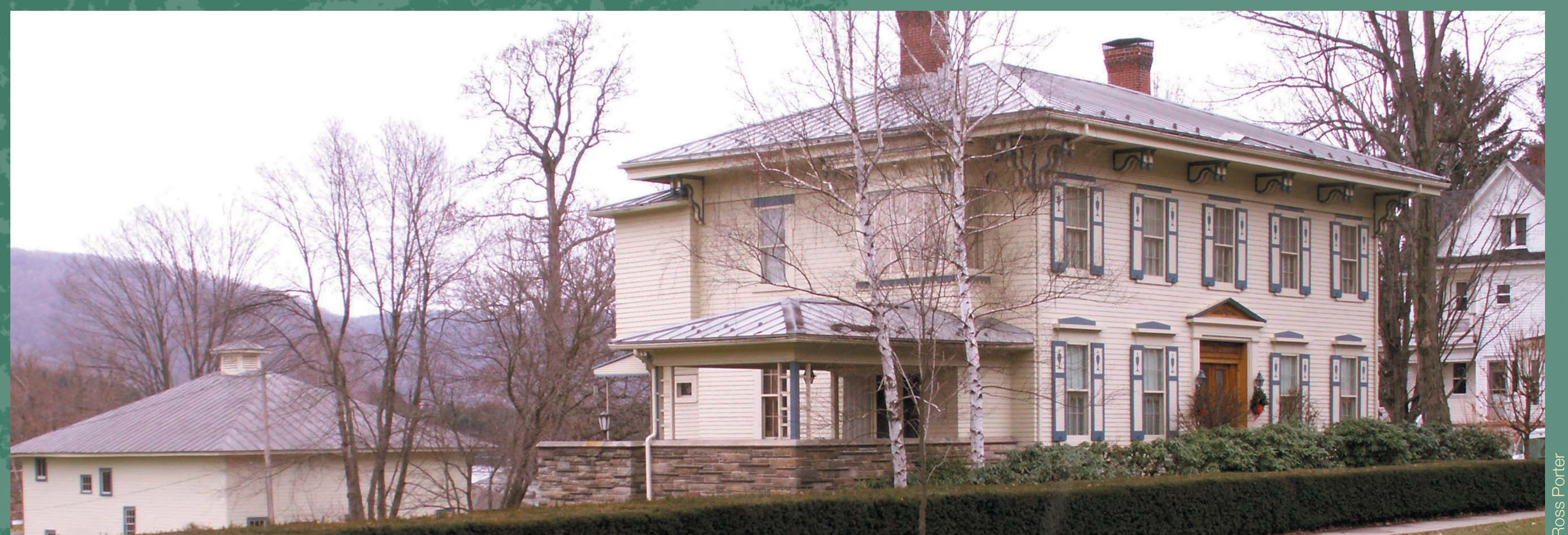
The Byron Delano Hamlin residence was built in 1860 and carefully restored in 1980s and 1990s.