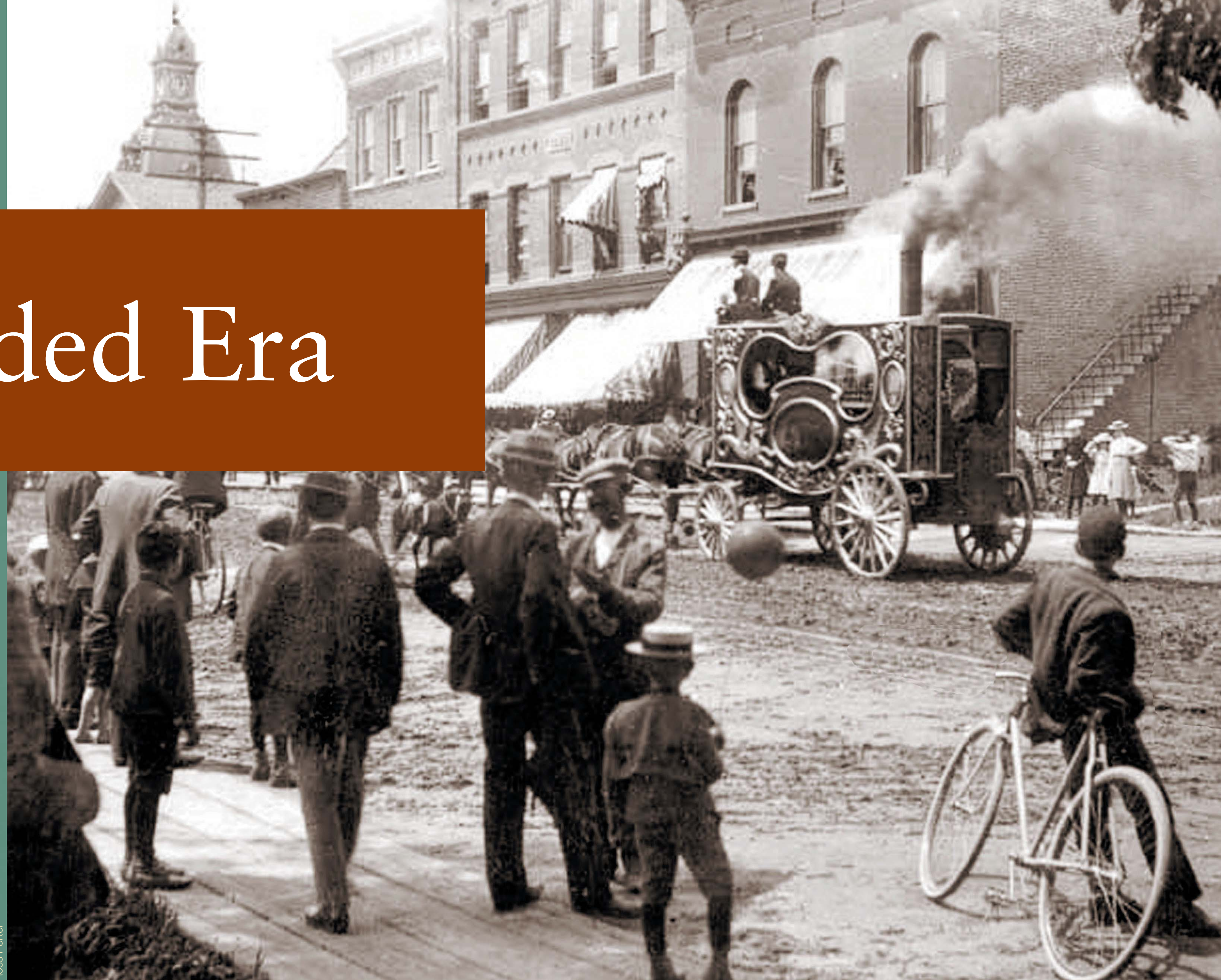
In 1906 the Sparks Circus came to Smethport with a massive calliope.

For detailed information about Smethport's mansion district, visit www.smethporthistory.org or contact the McKean County Historical Society located in the Old County Jail at the rear of the McKean County Courthouse.